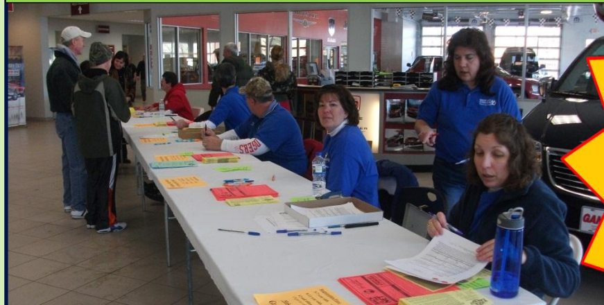
Green Bay Striker Board members ready themselves for registration of east side recreational soccer players and coaches. The Green Bay Strikers are Northeast WI largest recreational soccer club.